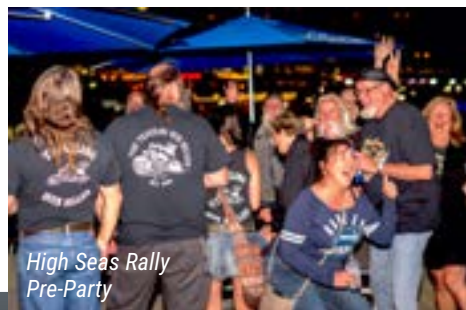
High Seas Rally Pre-Party