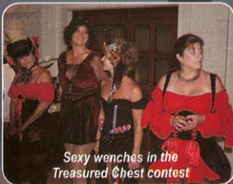
Sexy wenches in the Treasured Chest contest