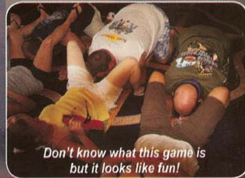
Don't know what this game is but it looks like fun!